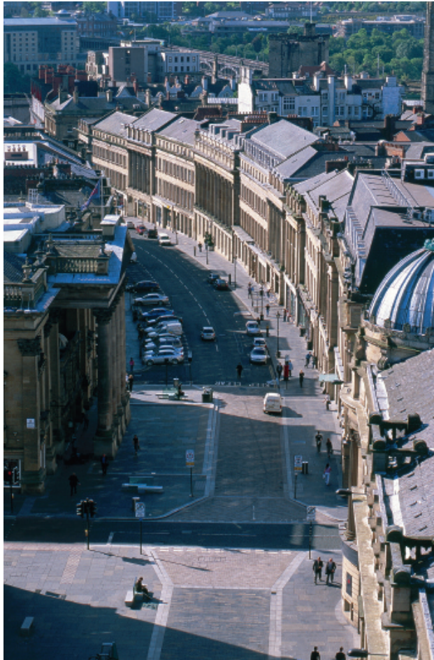
Above: The glory of Classical Newcastle: from Grey Street to the Castle Keep and High Level Bridge.